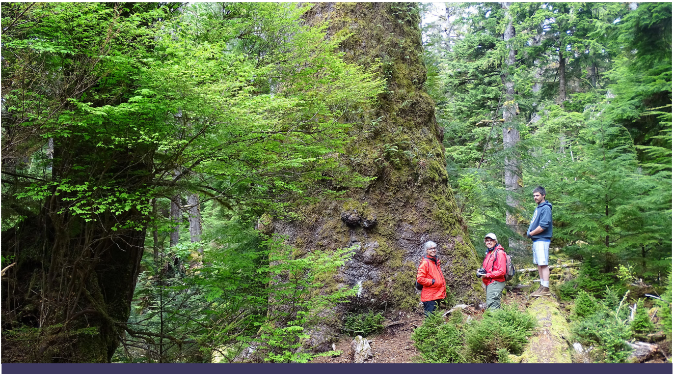
Canada's Gwaii Haanas National Park Reserve and Haida Heritage Site protects temperate old growth rain forests