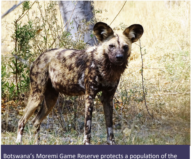
Botswana's Moremi Game Reserve protects a population of the endangered African wild dog ( Lycaon pictus )

The most comprehensive analysis to date (Butchart et al., 2012) of protected area coverage of important sites for biodiversity (specifically, Important Bird & Biodiversity Areas [IBAs], and Alliance for Zero Extinction [AZE] sites) showed that the proportion of protected areas which are IBAs or AZEs has been decreasing over time since the 1980s. Recent re-analysis shows that this negative trend has continued over the 2011–2019, that is, the timeframe of Aichi Target 11. This trend has been accompanied by a flattening of the